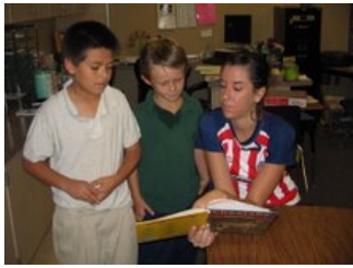
All students were actively engaged in learning