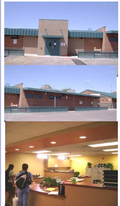
Littleton School remodeled space now serves as the new school office.

For more information on any of the above mentioned programs, please contact the LES office at 623-478-5700.