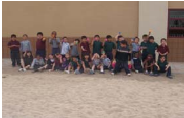
Kinder Camp is designed to provide information to future kindergarten parents and allow incoming kinder students to get comfortable with school and their teachers.

TRES RIOS IS THE SECOND LITTLETON ESD ELEMENTARY SCHOOL TO OPEN IN 2008.